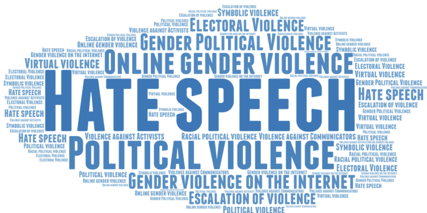
Word cloud of terms from the corpus of reports, guides and brochures compiled for this review. 46 Source: Own elaboration. Tool: https://wordart.com/

In this iteration of our research, we interrogate how feminist research and interventions in digital technologies conceive online violence against LGBT+s in the contemporary political scenario, from 2018 to 2021. The word cloud below, featuring the most used categories in our corpus of analysis, points to some present shifts shown in the meanings attributed to violence in feminist mobilisations: